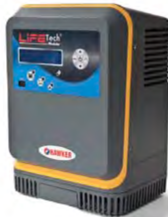
3 bay 1-phase charger