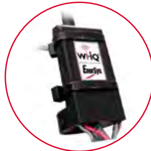
Wi-IQ ® optional