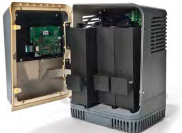
3 bay cabinet interior