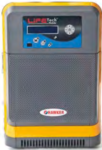
4 bay 3-phase charger