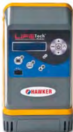
1kW Lifetech® charger