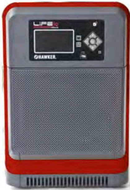
4 bay 3-phase charger