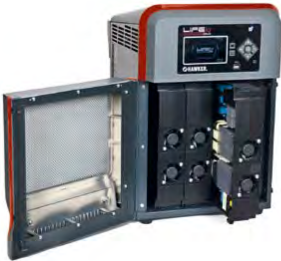
4 bay cabinet interior