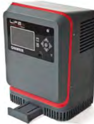
3 bay 1-phase charger